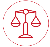
Labor & Human Rights