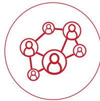
Diversity, Equity & Inclusion