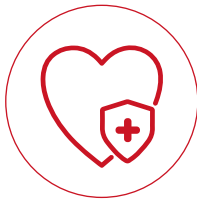
Health & Safety